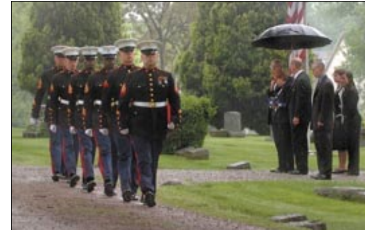
1st General News