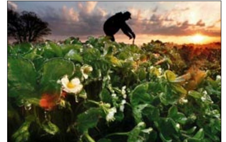
1st Feature