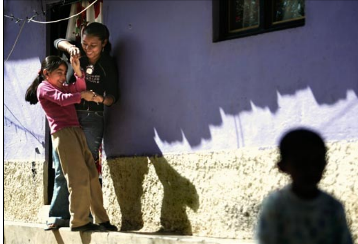
1st Portrait

University of Akron students pass through newly constructed archways as a gentle snow falls.