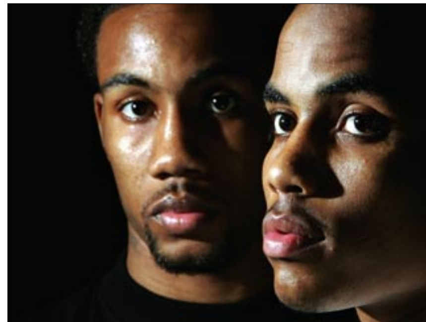
1st Portrait