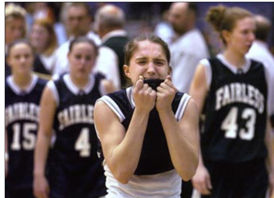
1st Sports

A neighbor carries a baby that was rescued from a house fire on Camden Avenue in Lorain.