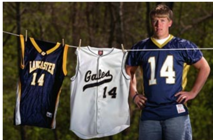
1st Portrait