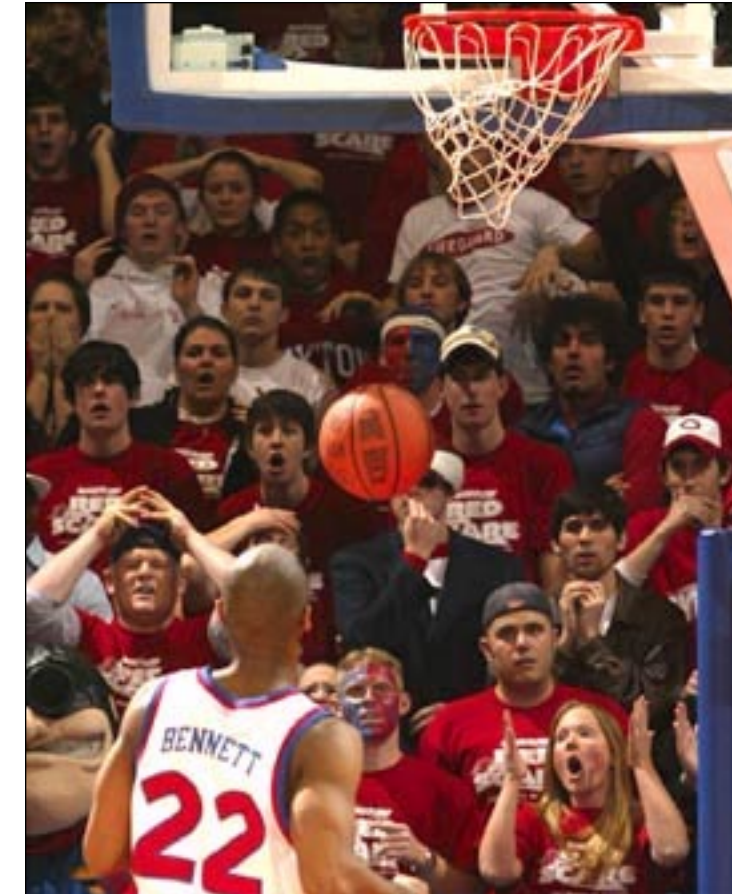
1st Sports