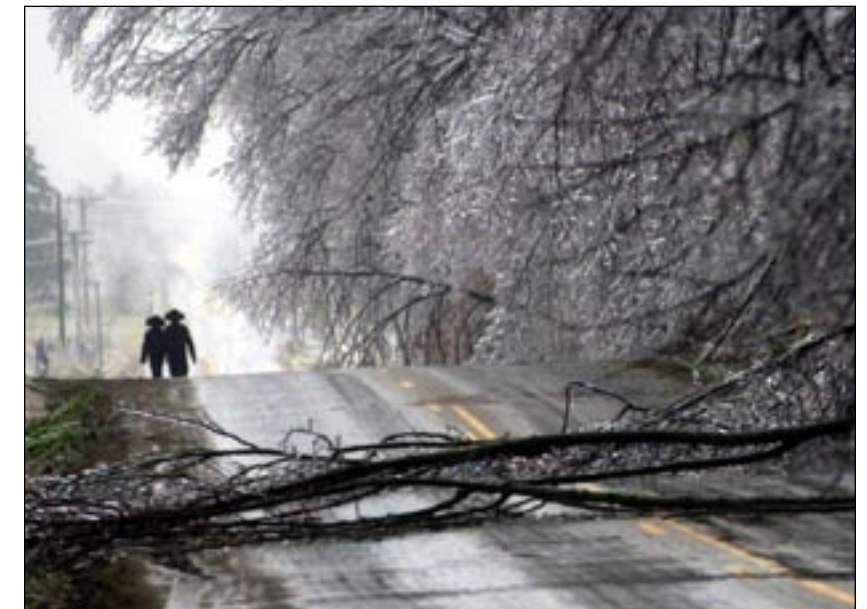
Tom E. Puskar - Ashland Times-Gazette 1st Feature

Two Amish men walk along County Road 500 in the morning mist as downed trees lay across the road and ice hangs heavy on branches lining the road.