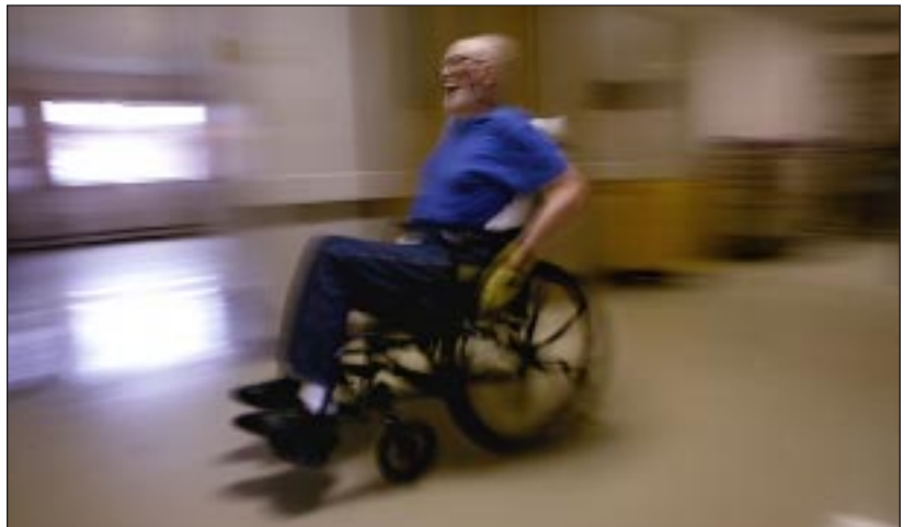
1st Portrait March