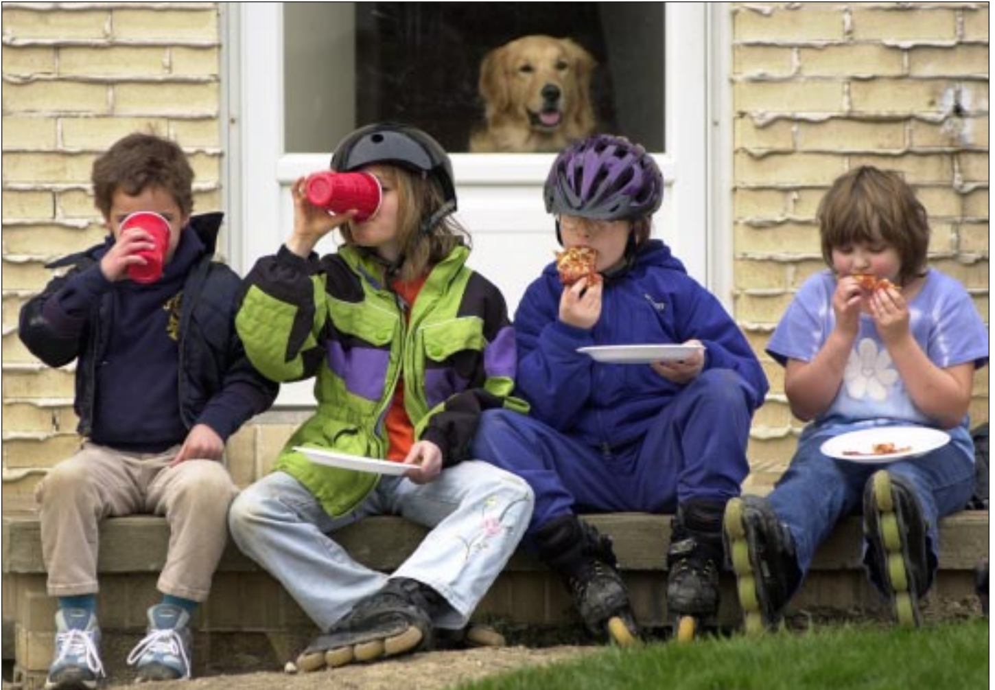
Scott Shaw The Plain Dealer 1st Feature Single -- April