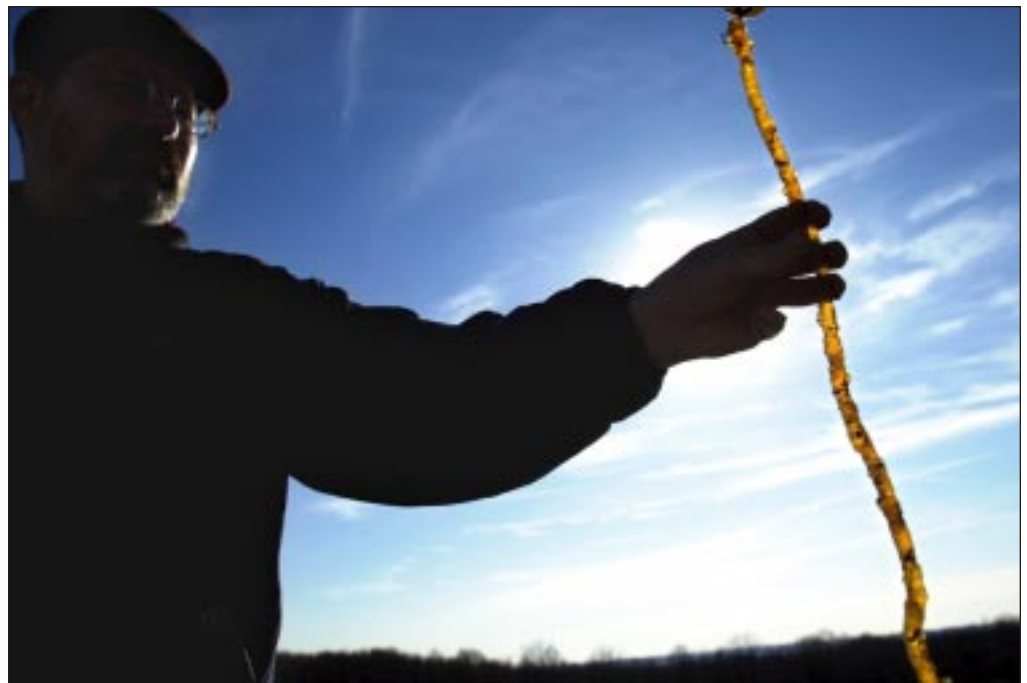
1st General News March